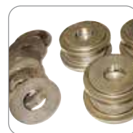
Modular Tooling Set