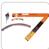
Radius & Degree Measuring Kit