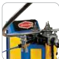
Large Spiral Accessory