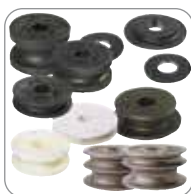
Pipe & Tube Tooling