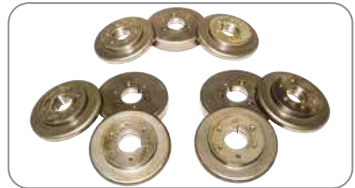
Universal Tooling Set Included for Multiple Profiles