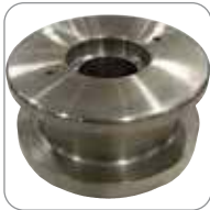
Roller Counterbending Die