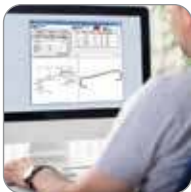
Easy Part Layout Software