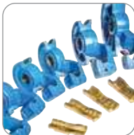
Tube & Pipe Tooling Kits